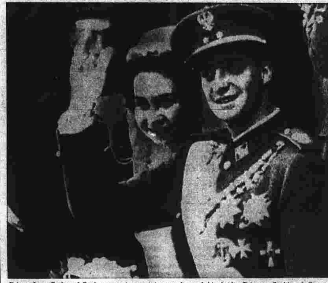
Prince Juan Carlos of Spain waves to spectators as he and his bride, Princess Sophie of Greece, leave Roman Catholic Cathedral of St. Denis in Athens today.

NEW YORK (AP)—A nervous stock market fell sharply today under a heavy wave of selling and then steadied. The ticker tape ran 29 minutes late.