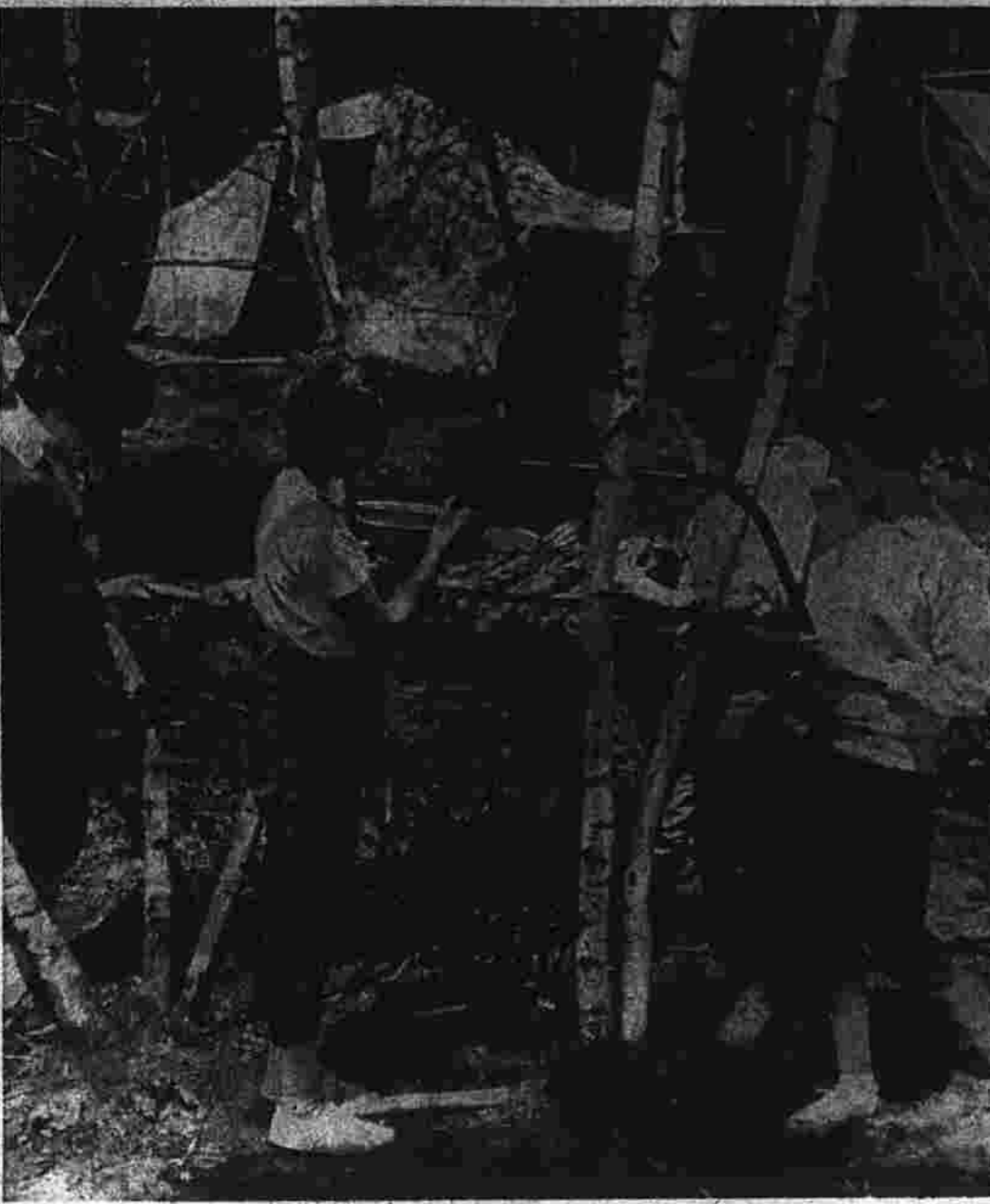
Stages in Concert

HARTFORD (AP)—Herbert Hoover Jr. of San Marino, Calif., son of the former President, has been elected president of the American Radio Relay League.